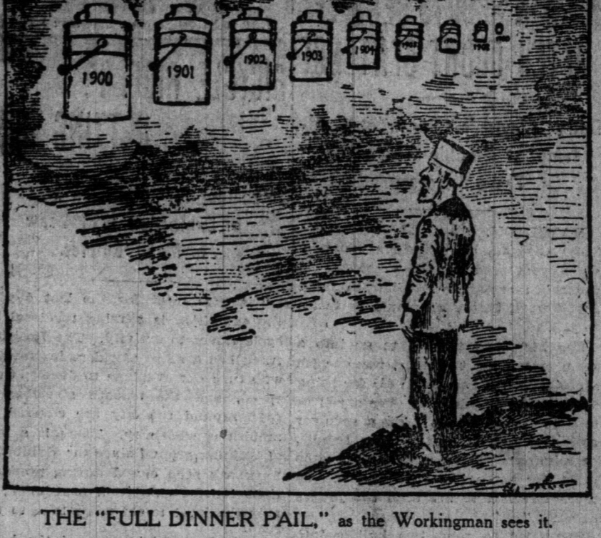
THE "FULL DINNER PAIL," as the Workingman sees it.