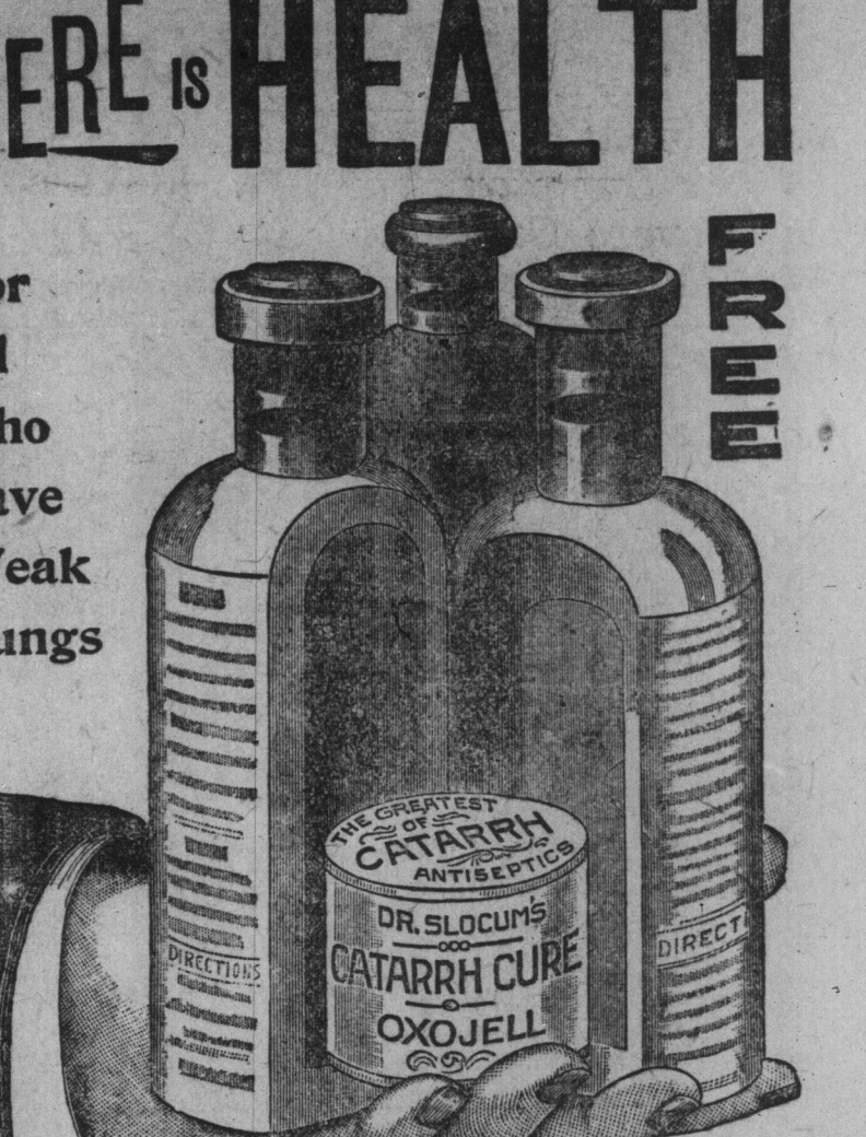
This is a Positive Cure for all Throat and Lung Troubles, also CONSUMPTION

On the Ladies' Auxiliary. On Feb. 18 and 19 will hold a bazaar, the proceeds of which will go towards furnishing the Spadina armistice quarters.