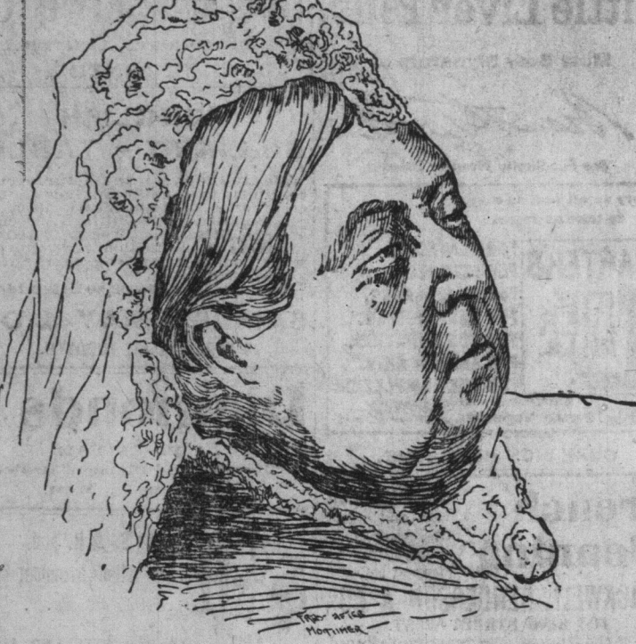
OSBORNE, Isle of Wight, Jan. 19.—This official announcement re the Queen's health has been issued: "The Queen has not lately been in her usual health, and is unable for the present to take her customary drives. The Queen, during the past year, has had a great strain upon her powers, which has rather told upon her nervous system. It has therefore been thought advisable by Her Majesty's physicians that Her Majesty should be kept perfectly quiet in the house and should abstain from the present from transacting business."

AN EMPIRE IS SHOCKED. Altho No Cause for Alarm, Still the Effect of the Announcement is Head to Foot. London, Jan. 19.—Altho it is fully understood that there is no cause for alarm, but the effect of the announcement is head to foot. It is necessary to go back to a date prior to 1870 for a similar situation. Since that time there has never been an interruption of the smooth working of the constitutional machine. No one, not even the Prince of Wales, can set for the Queen without the authority of Parliament, and no steps have been taken to summon Parliament which they do not regard it as a matter of course to do so.