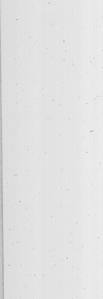
This is a Positive Cure for all Throat and Lung Troubles, also CONSUMPTION

Prices from $800.00 upwards. Terms of payment to suit any pocket.