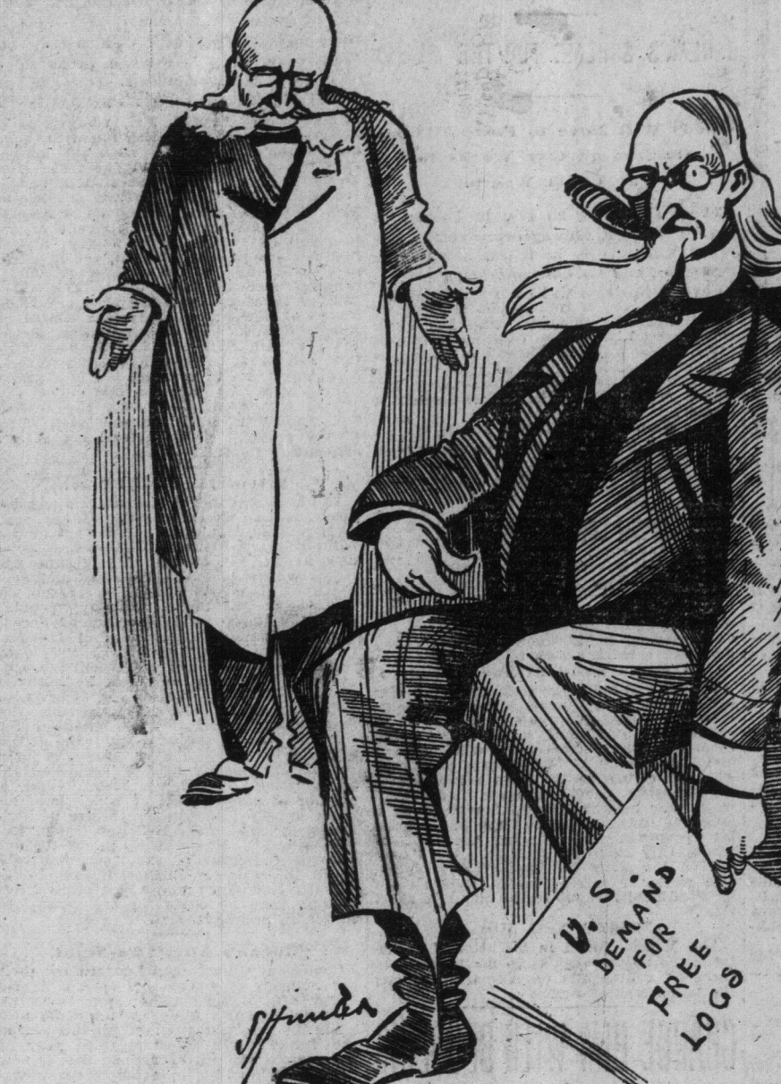
SIR RICHARD: How are you to secure free logs? Why, all you have to do is to induce Herschel to induce Laurier to induce Hardy to induce the Ontario people to let you have them. That's all.