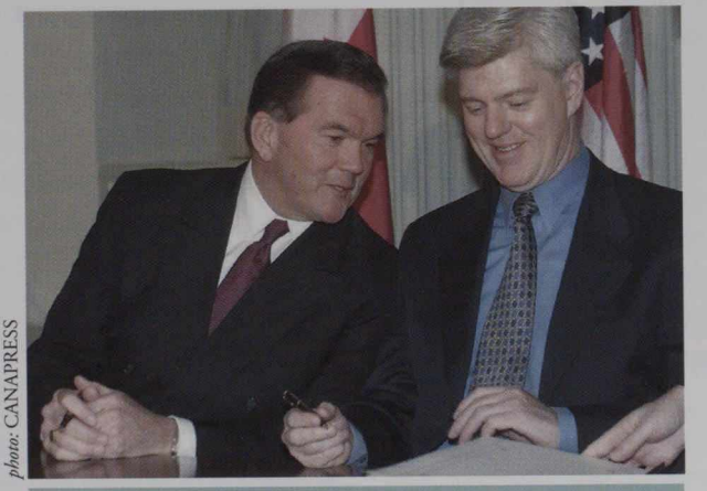
Foreign Affairs Minister John Manley (right) and U.S. Homeland Security Director Tom Ridge prepare to sign a declaration for the creation of a Smart Border for the 21st century between Canada and the United States, Ottawa, December 12.

And don't forget, with only 12 ratifications to go (as of December 31), the International Criminal Court will play an enormous part in the global fight to eliminate impunity for the most serious crimes known to humankind-including terrorism that amounts to genocide, crimes against humanity or war crimes.