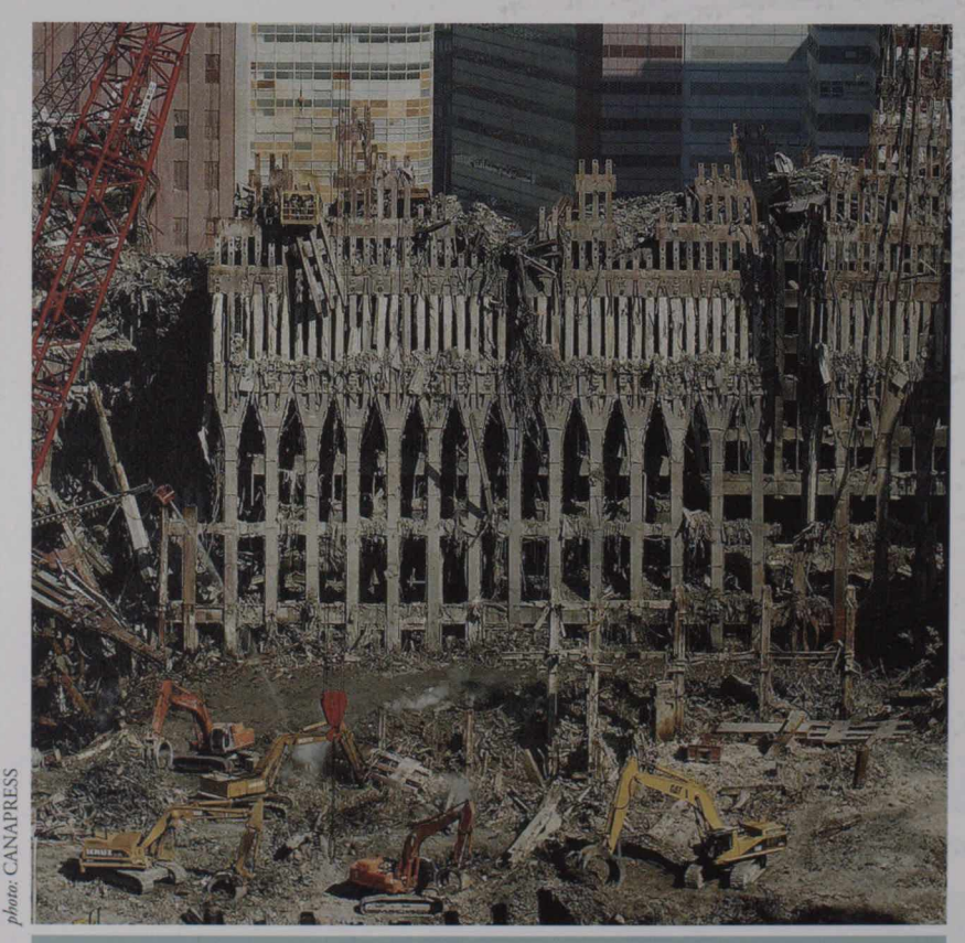
The ruins of the World Trade Center in New York

On any given day, up to 200 000 Canadians may be in New York City, working, shopping or visiting tourist sites like the Statue of Liberty or the World Trade Center. Consulate staff feared that Canadians could well be among the 5000 missing. In addition, many Canadian citizens who lived in the