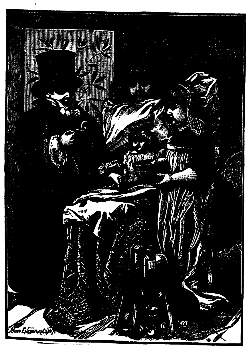
A LEARNED M. D.