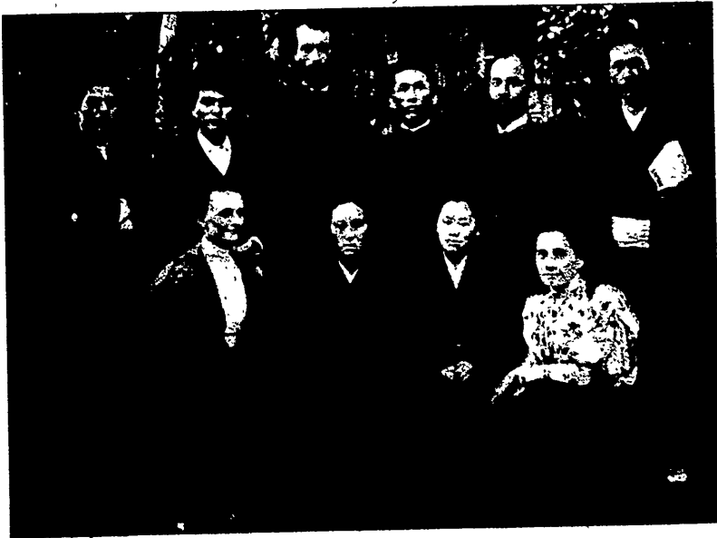
C.C.M.A. Missionaries of Nagoya.

did not attain its growth in a century. The growth of the Church of England is like the growth of a mighty nation, with its artless infancy and wilful childhood, its erring youth and amended age. Its history is the story of faults and struggles; of errors and aspirations; of decline and falls; of despair and victory. It is like the history of a man who has worked out through the shocks of battle and the mistakes of the past, the character he has finally attained. It is the old, old story of the prodigal son, who sank and sinned, but afterwards arose and came to his father a re-