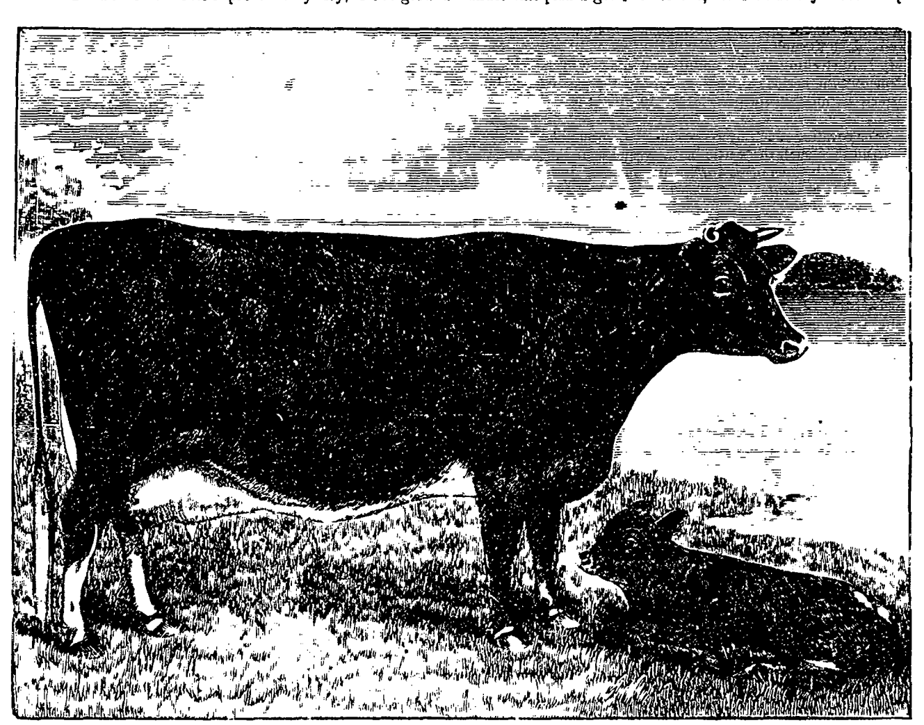
IMP. GUERNSEY COW, ROSEBUD OF LES VAUXBELETS 4TH.

When I take a man out to show him what a growth of clover there is on my stubble fields I am usually asked, "Can you afford to use all this clover for the land? Why don't you out it?" I smile as I reply, "Before I adopted this plan I put twelve loads of manure on an acre, which cost me $9 in money and three days of hard work with a team, while this clover has cost me only the outlay for seed and sowing, which is rarely $1 per acre. My land is cleaner and more easily worked than if I used manure, and I believe that under this plan I get $15 for one, for I value my clover crop