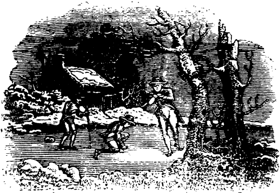
Amusements of the Acadians.