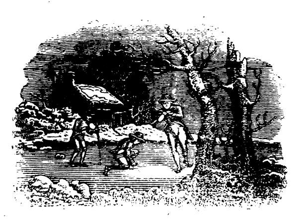
Amusements of the Acadians.