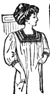
Sale price, 95c