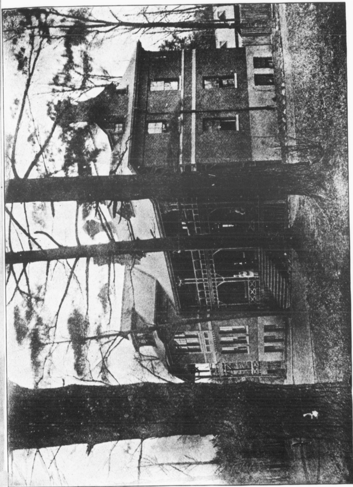
HILLCREST CONVALESCENT HOME, WELLS' HILL, TORONTO.