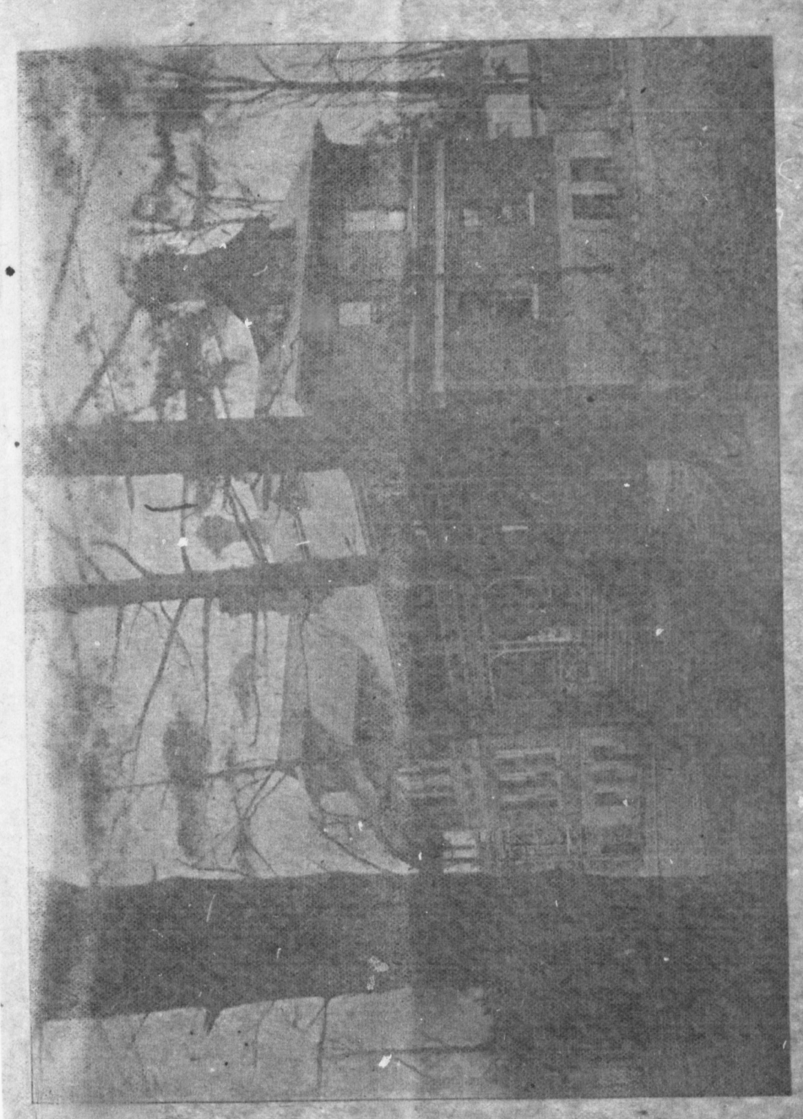
HILLCREST CONVACESCENT HOME, WELLS HILL, TORONTO,