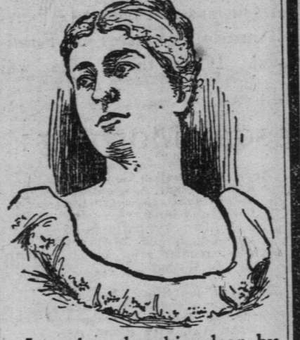
It makes the skin clear by making the blood pure. No better beautifier than B.B.B.