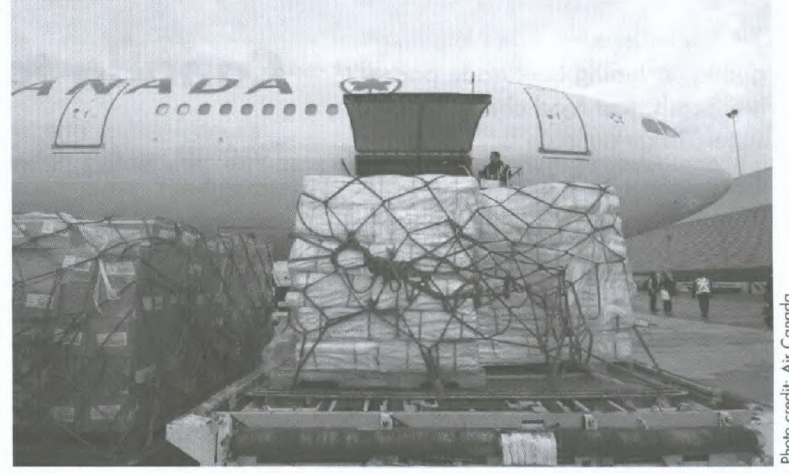
Canadians are getting on-board: An Air Canada A340 headed for Jakarta is filled with much-needed supplies.

For their part, many Canadian companies have come forward to help the victims of the tsunami. The world's leading fertilizer producer, Potash Corp of Saskatchewan Inc., announced it would donate some $1.2 million. Brampton, Ontario-based Nortel Networks and its employees have provided more than $1 million in assistance. Mining company Inco and its Indonesian subsidiary, PT International Nickel Indonesia, have provided $540,000, and Telus, Canada's second-largest telephone service provider, donated $500,000. Canadian Tire, Home