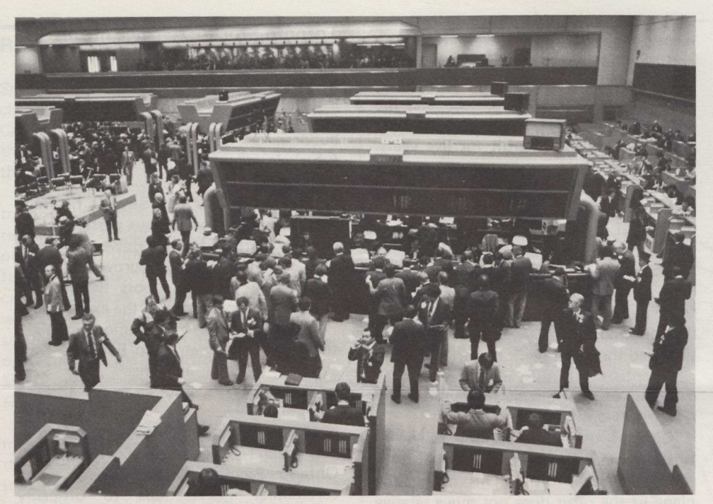
Toronto Stock Exchange moves to hi-tech tower after 40 years on Bay Street.

opened in 1937, following the amalgamation in 1934 of the TSE and the Standard Stock and Mining Exchange.