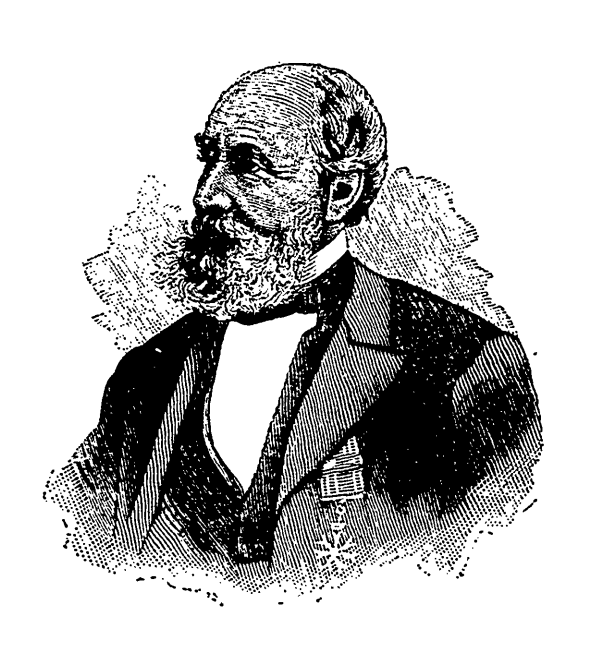
SIR WILLIAM DAWSON.