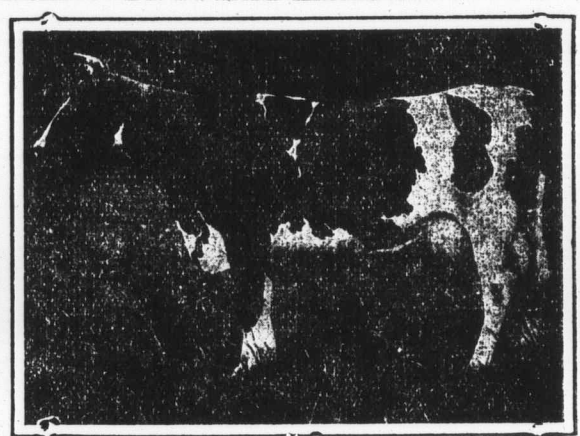
Lakeview Dutchland Artis: Canadian Champion Senior three-year-old in the seven day division.