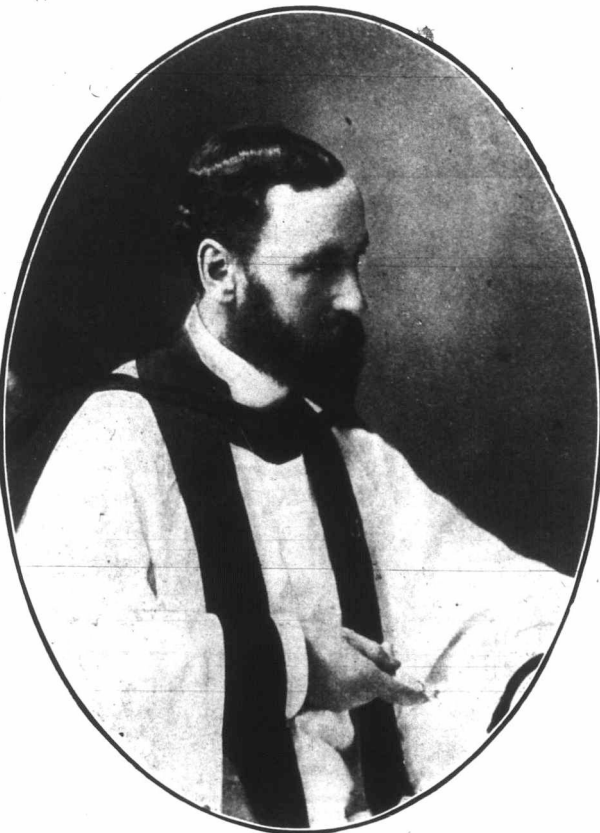
The Ven. Archdeacon Sweeny, D.D., Bishop-Elect of Toronto.

We speak the experience of many clergy when we say that great uncertainty prevails in many minds concerning certain details in the administration of the Lord's supper. The Scottish Church recently gave a good deal of attention to one question, viz., the formula proper to be used in administering the Sacrament in case of largely attended Communion. Is it right to say the whole formula to a raftful of people and then administer without saying more? Or is it right to split the formula and say only half of it? These are some of the many questions that ought to be threshed out at deanery meetings and Church conferences. The Scottish Church decided to let each Bishop (if he wished on certain days) authorize the saying of the whole formula in the singular, and then the first half in communicating individuals.