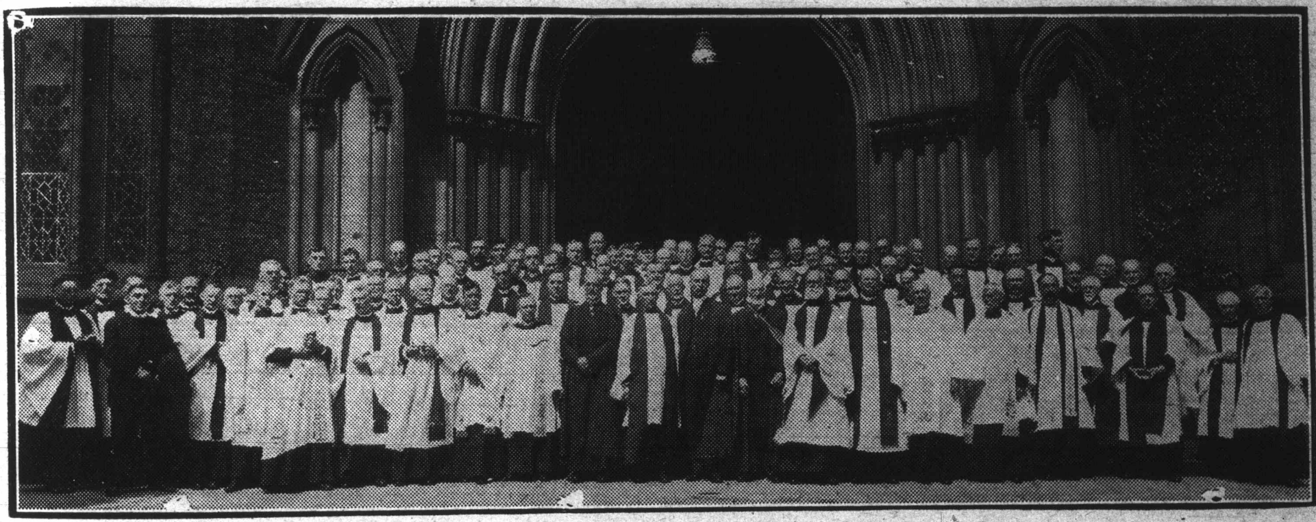
THE LOWER HOUSE OF THE GENERAL SYNOD, 1918.

The kindness shown by all troops to the Canadian Bishop who was their missioner was very keenly appreciated, and one incident deserves recording. A deputation came into the vestry on the last night, consisting of a Padre, and four C.E.M.S. men who asked me to accept the offerings, taken up at a church parade service they had held that day "for the missionary works of