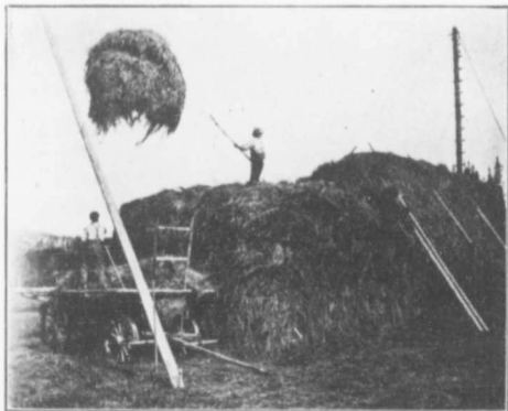
A haying scene on Pioneer Ranch, in the Bulkley Valley

There is probably no section in the whole Dominion that offers equal inducements to the settler, particularly to the practical farmer who is willing to work and who knows how to cooperate with the soil and the seasons to bring forth the maximum yield from his carefully tilled acres. The various authorities on agricultural subjects who have visited the Bulkley Valley speak of it in the highest terms as specially well