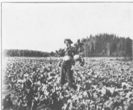
Fifteen pounds each—giant turnips raised in the Bulkley Valley

13. A pre-emption cannot be staked or recorded by an agent.