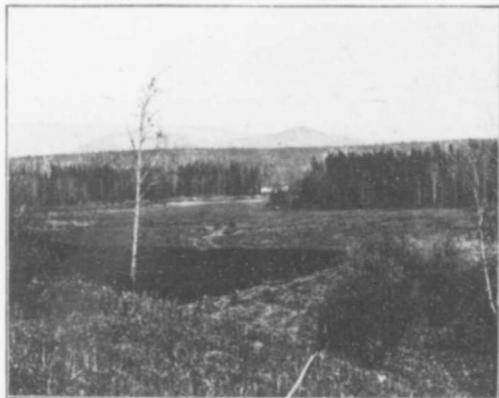
A Bulkley Valley farm in the Spring

"We were a trifle late in the season to see the farm at the height of its beauty, inasmuch as the hay, wheat and barley had been garnered. There