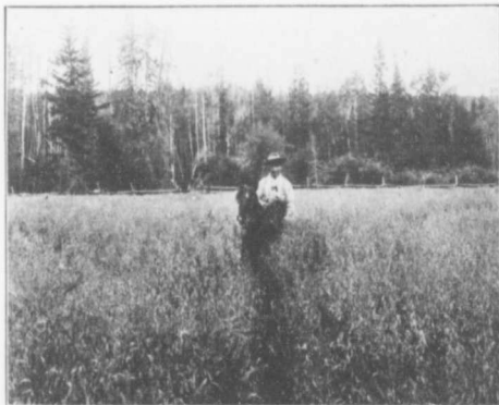
A typical outfield in the Bulkley Valley

"The prospector has been busy in the mountains surrounding the Bulkley Valley and there were many rumors of big strikes. Here it was a heavy find of galena; there one of silver; coal abounded somewhere else; gold was the reward of another prospector's persistence; while copper seemed to be abundant on all sides. The pros-