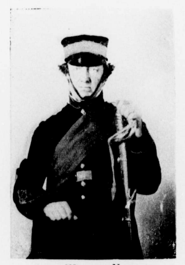
CAPT. WILLIAM NOTMAN.