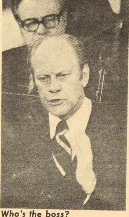
Who's the boss?

When the CIA organized the Chile coup, perpetrated the Phoenix Program that murdered 20,000 Vietnamese, conducted a secret war in Cambodia, installed reactionary governments in Guatemala, Iran, Brazil, South Vietnam and a score of other nations, backed puppet "liberation" movements, in Angola, masterminded the Bay of Pigs