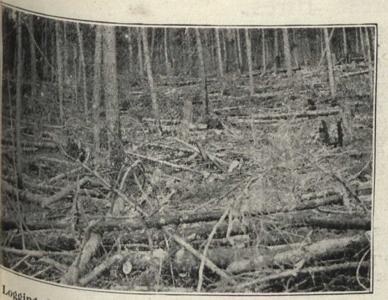
{ m L_{ogging}} { m slash} before burning. A most dangerous fire trap