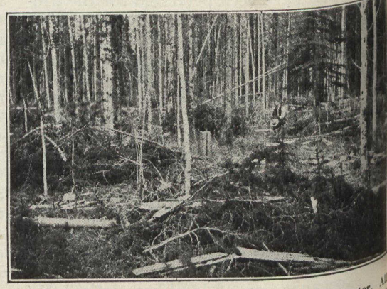
Slash on logged over area piled so as to reduce fire danger, being the contractors working on the 2,000 miles of railroad being constructed in B.C. are now required to pile slash.

To be at all safe or effective against July or August fires, fire-breaks must consist of a strip 5 to 10 feet wide cleared to mineral earth and a strip 10 to 30 feet