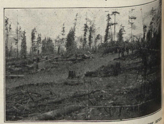
Showing where slash has been burned on logged over are No danger of fire now.

wide cleared of brush, inside which all dead snags standing within a distance of 100 feet must be felled.