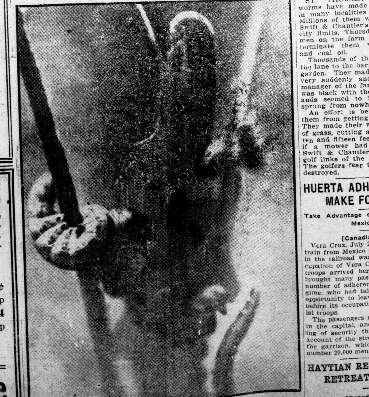
[From The Hamilton Spectator.] This picture shows the actual size of the army worm. All that remains taken when two of the parasites were lurching on a corn stalk. The stalk testifies to the deadly work of the pest.