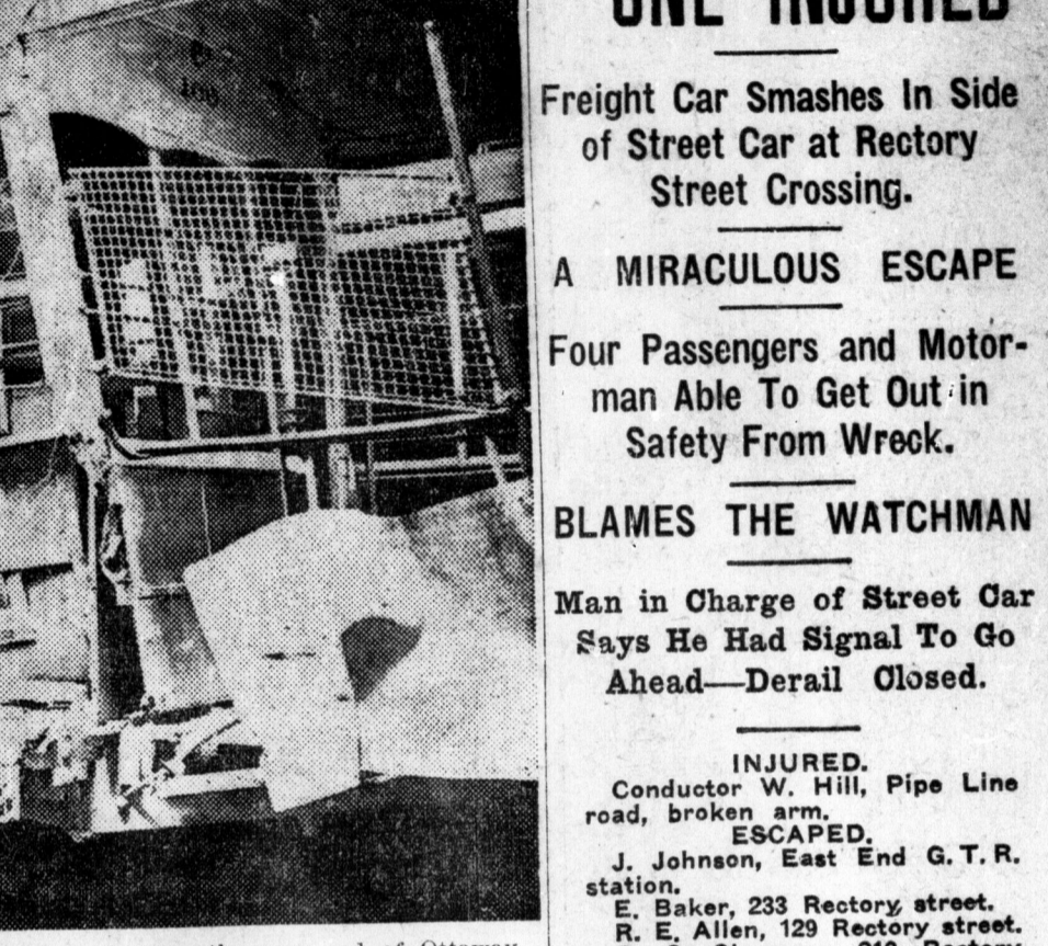
Photograph made in repair barns of the London Street Railway this morning, showing the rear end of Ottawa car No. 199, struck at the Rectory street crossing of the Grand Trunk last night by a freight car. The picture indicates what a miraculous escape was made by the four passengers who were sitting in the two rear seats of the car when the south-bound car was "swiped" by the switching engine and car coming from the west.