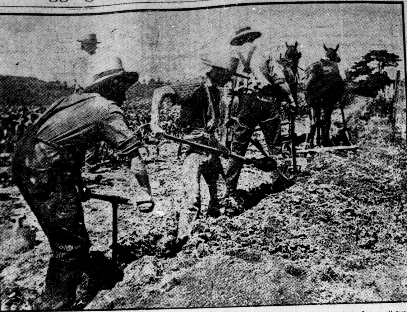
This picture gives some idea of the trouble the army worm is putting the farmers to. Large gangs of men all over the country are busy digging trenches in which to trap the pests.