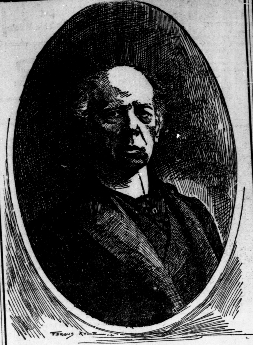
SIR WILFRID LAURIER.

New York $10.00 Round trip from Buffalo and Suspension Bridge, Thursday, August 13, via West Shore R.R. Special trains will leave Buffalo at 9:00 p.m. and $11.40 p.m. Tickets optional between Albany and New York on Hudson River steamers. Return limit, August 22. Dining Service. Consult local ticket agents for