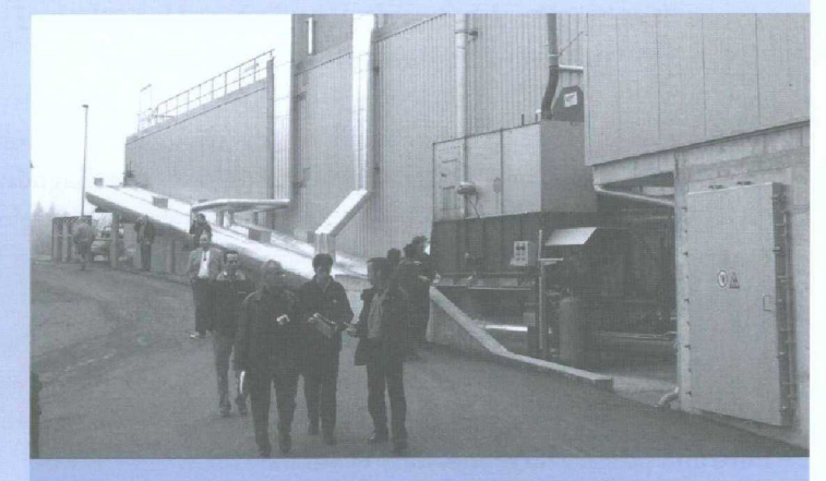
The Canadian delegation visited biogas plants in southern Germany and Austria.

In fact, this is one of the most effective methods of converting biomass to energy. The methane in biogas can be used to either fuel electrical generators or, with suitable