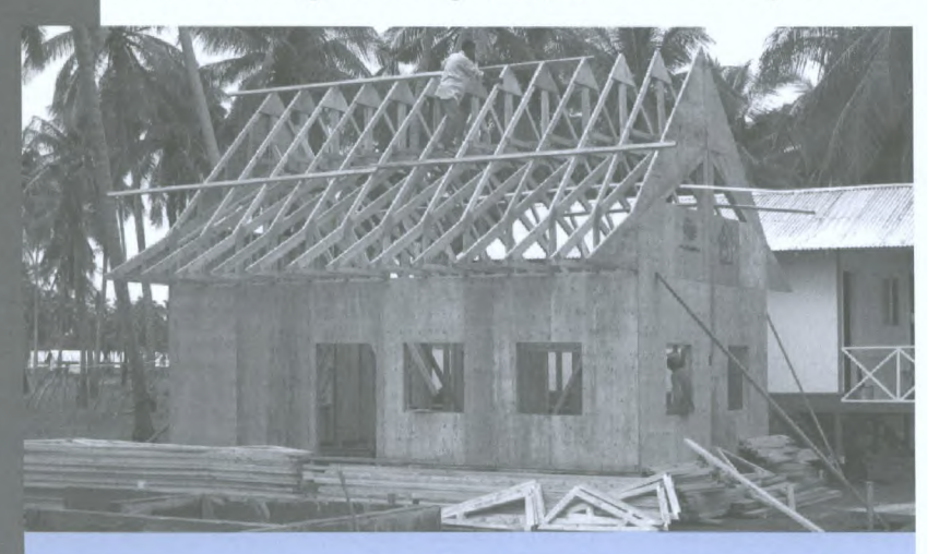
Canadian companies have contributed 10 wood-frame homes to the Labui Eco-Village in Banda Aceh, Indonesia.

for proper shelter construction. Intermap recently received funding from the Canadian International Development Agency (CIDA) to expand its technology transfer to Indonesia by training Indonesian GIS technicians to use radar data for the construction of topographic line maps.