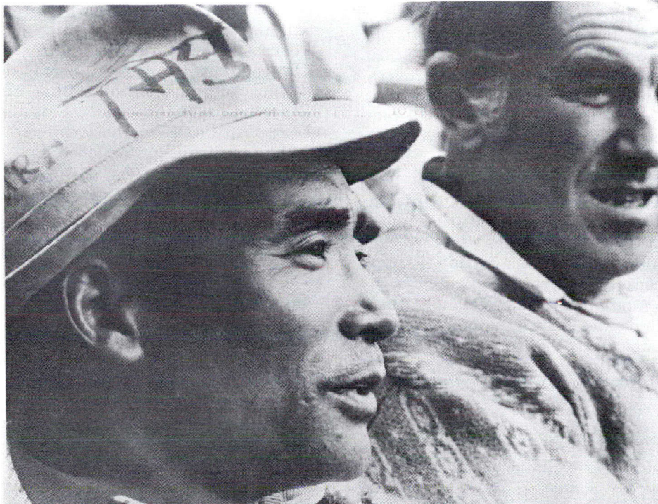
Yuichiro Miura and Sir Edmund Hillary discuss Miura's historic feat in The