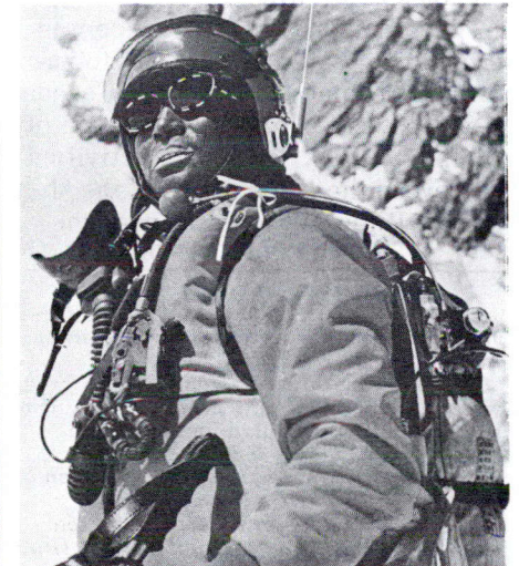
Yuichiro Miura prepares for his run in The Man Who Skied Down Everest.