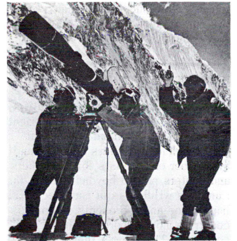
Yuichiro Miura and the technical crew discuss a camera angle.

The Man Who Skied Down Everest is a film of a Japanese skier on a Nepalese mountain and it has won a United States award. So Crawley Films is certainly continuing to emphasize its specialty – international production.