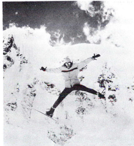
Full speed ahead – Miura practises for the final take in Everest.

Crawley Films have made some 2,400 motion pictures since their founding in