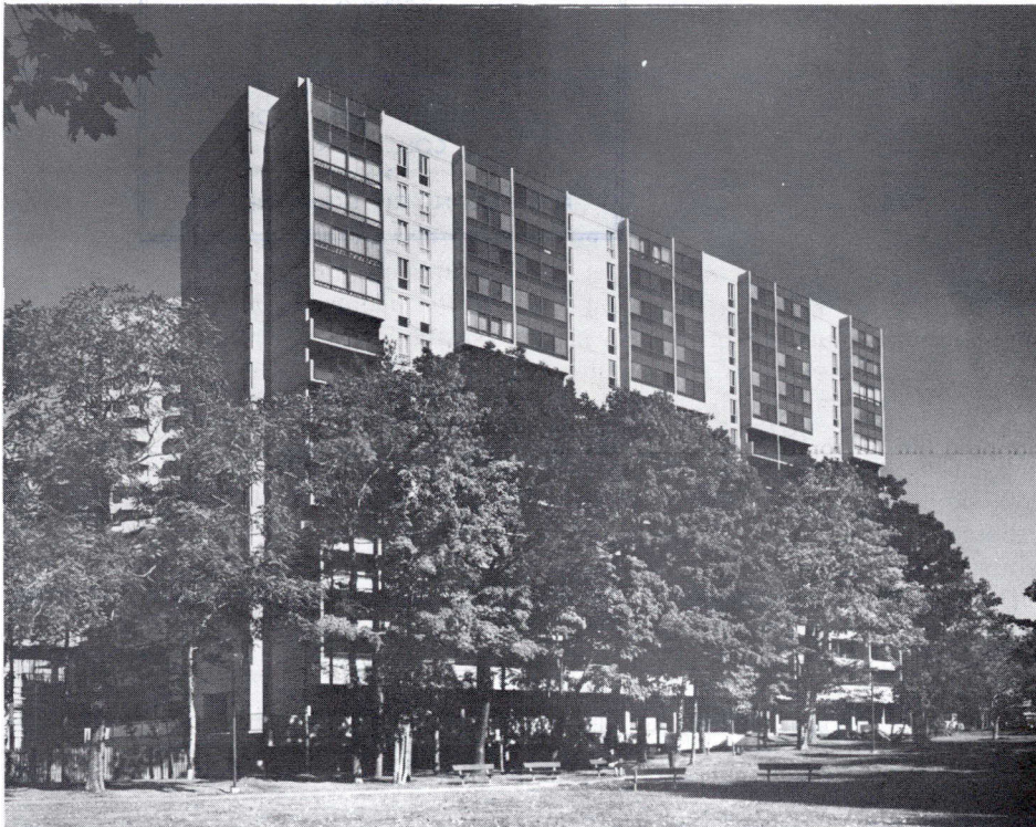
Rental apartments, Quebec City, financed under the National Housing Act.

jobs in the construction industry and associated businesses.