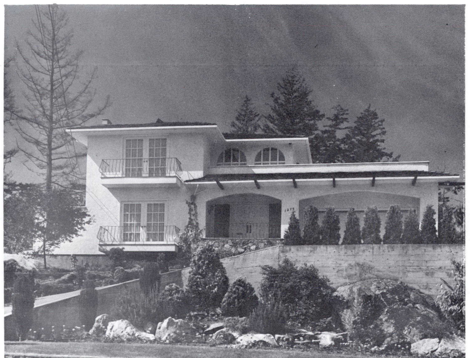
Single family home – non-NHA – in Victoria, British Columbia.