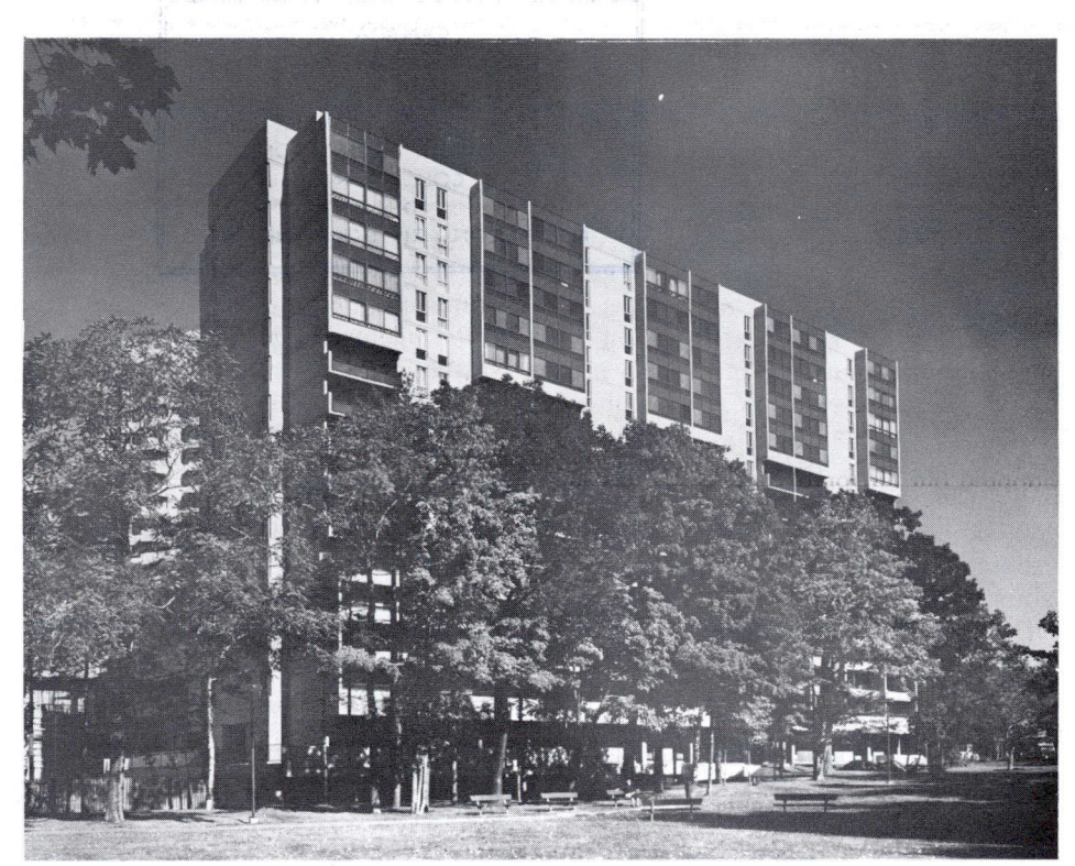
Rental apartments, Quebec City, financed under the National Housing Act.

jobs in the construction industry and associated businesses.