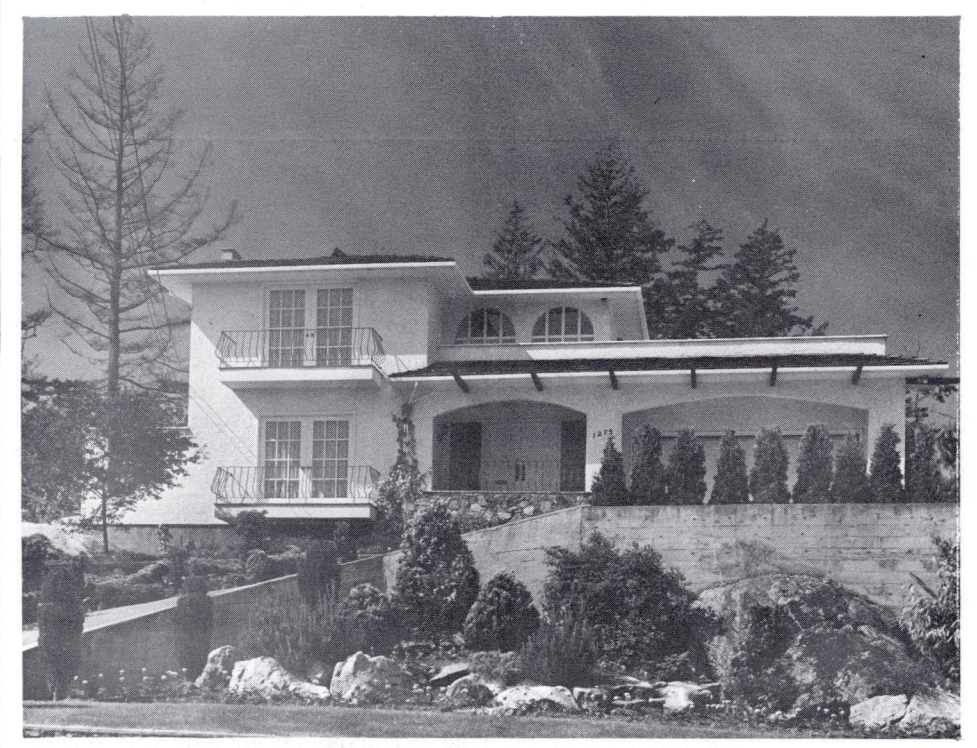
Single family home - non-NHA - in Victoria, British Columbia.