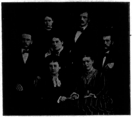
THE SERVING SEVEN