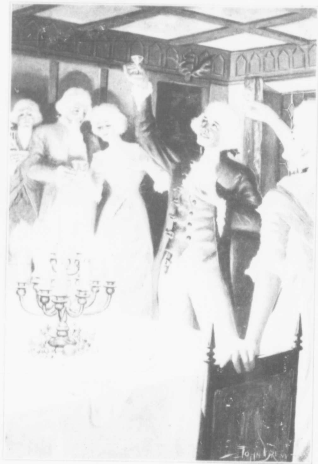
"The Sweetest Part of the Game"