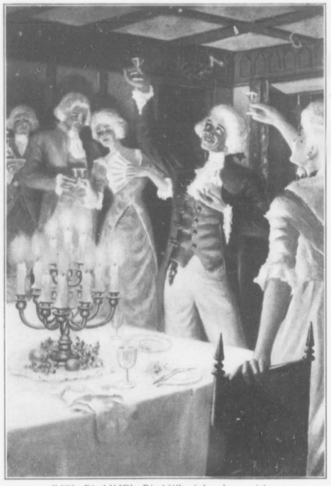
"The Rivals'!" 'The Rivals'!" cried each one, rising Page 47