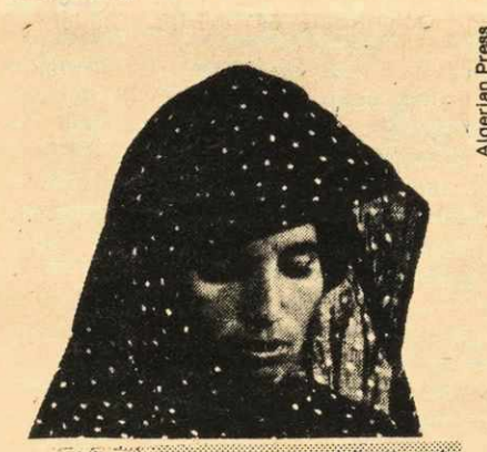
Woman supporter of Polisario movement in Western Sahara

The origins of annexation of the former Spanish colony can be found in the expansionist policies of Morocco under the feudal Dictatorship of King Hassan 11. Control of Sahara is just the first step in a move to annex