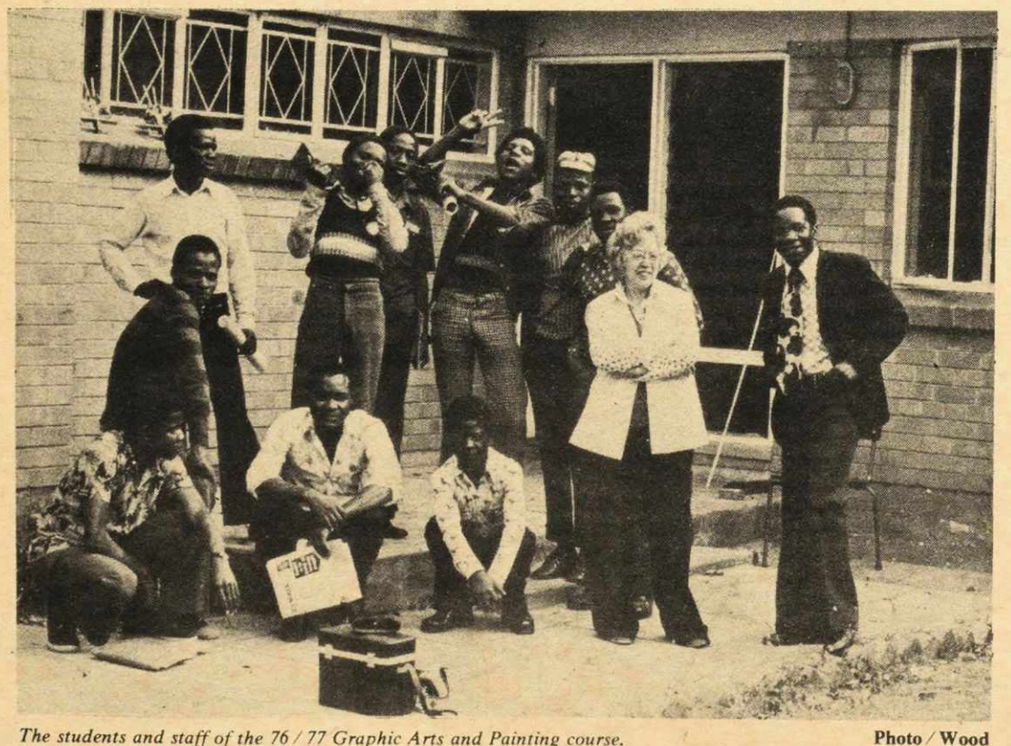
The students and staff of the 76 / 77 Graphic Arts and Painting course.

Socializing was not confined to Mindolo staff, however. From time to time I would accompany friends to some of the local country bars. I favored these places to the more sophisticated establishments downtown because the patrons really knew how to let loose and have a good