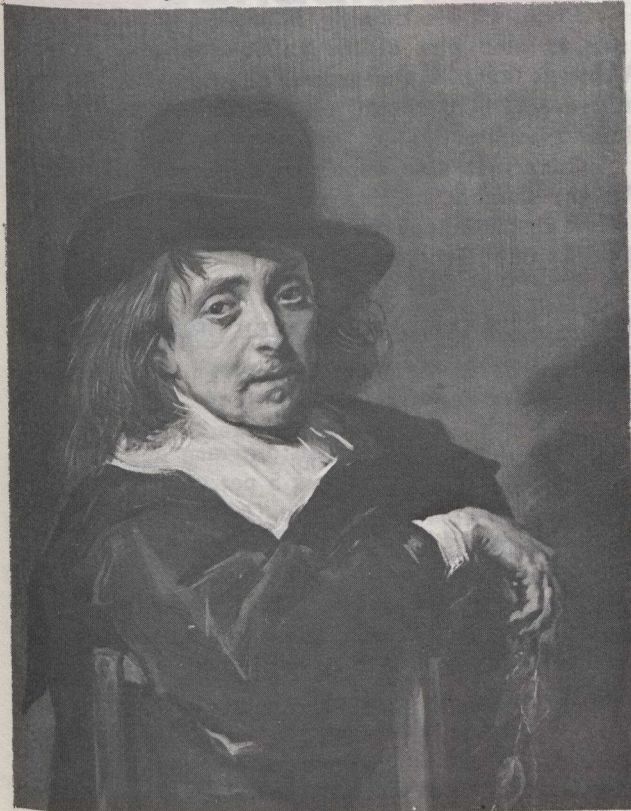
The National Gallery of Canada, Ottawa