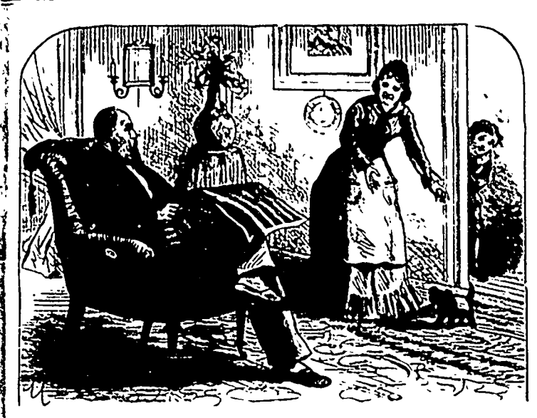
THE LITTLE BLACK DOG.