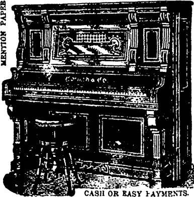
CASH OR EASY PAYMENTS.

and for a complete description of the instrument made by us, see OUR NEW SOLVING CATALOGUE FOR 1900, handsomely illustrated in colors. The most complete in such catalogue in the trade. The frontispiece is a masterly reproduction in facsimile of an interesting oil painting, designed and executed for us by an eminent artist, representing "SAINT CECILIA AND THE ANGELIC CHORUS." This beautiful catalogue is sent CHARGES PREPAID, and we also include our novel reference book, "THE HEART OF THE PEOPLE."