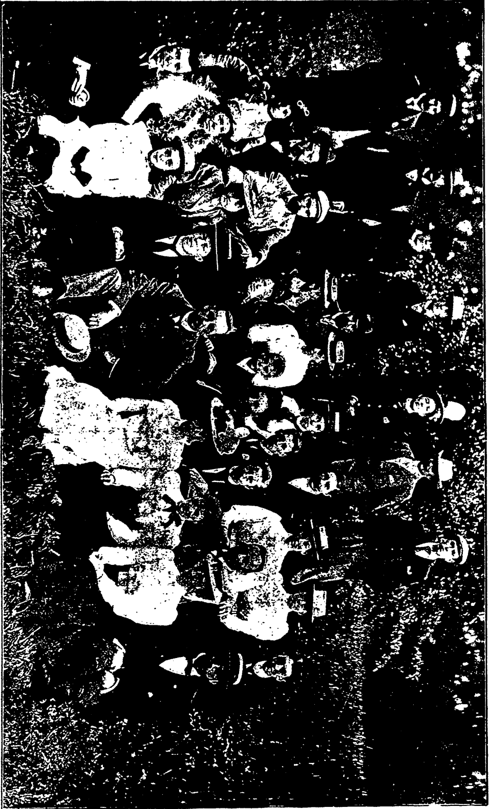
“The button snapped, and the work was done.”