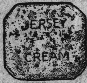
1/2 Actual Size.