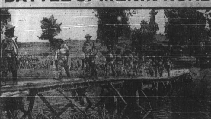
Battle of Menin Road,-Infantry crossing the stream after having driven the Hun back

Artillery crossing the Yser.