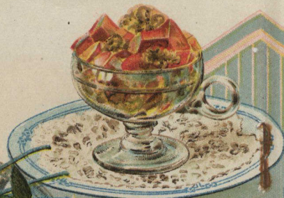
MAPLE WALNUT JELL-O