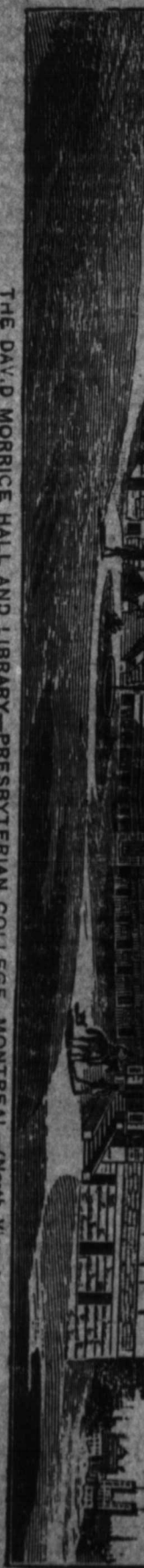
THE DAVID MORRICE HALL AND LIBRARY—PRESBYTERIAN COLLEGE, MONTREAL—(North View.)