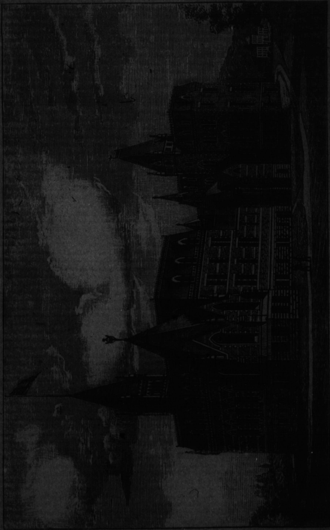
THE DAVID MORRICE HALL AND LIBRARY—PRESBYTERIAN COLLEGE, MONTREAL—(South View )