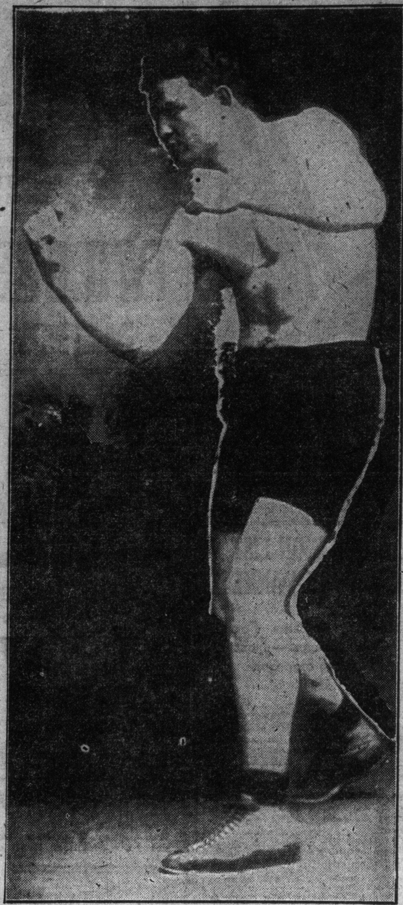
Luther McCarty, hailed as heavy weight champion of the world after putting out Al. Palzer in the 18th round at Los Angeles.