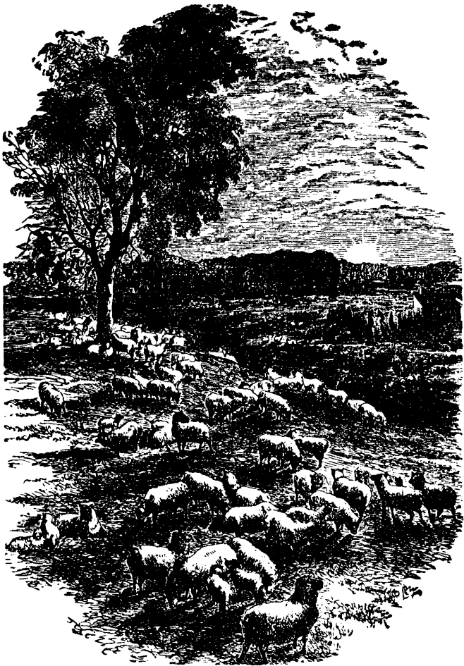
THE FAITHFUL SHEPHERD BOY.