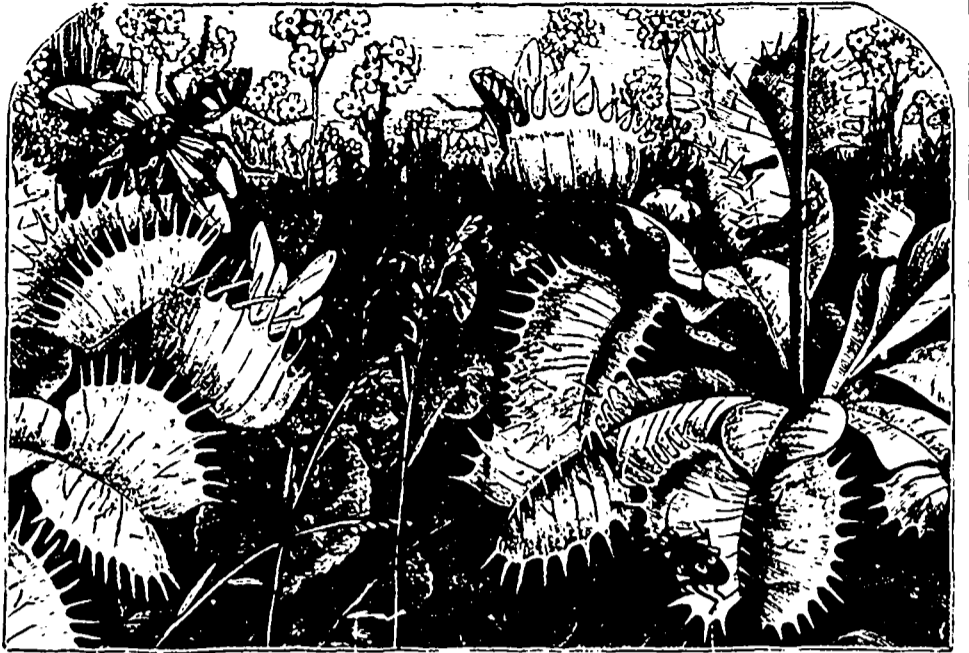
VENUS FLY TRAP.