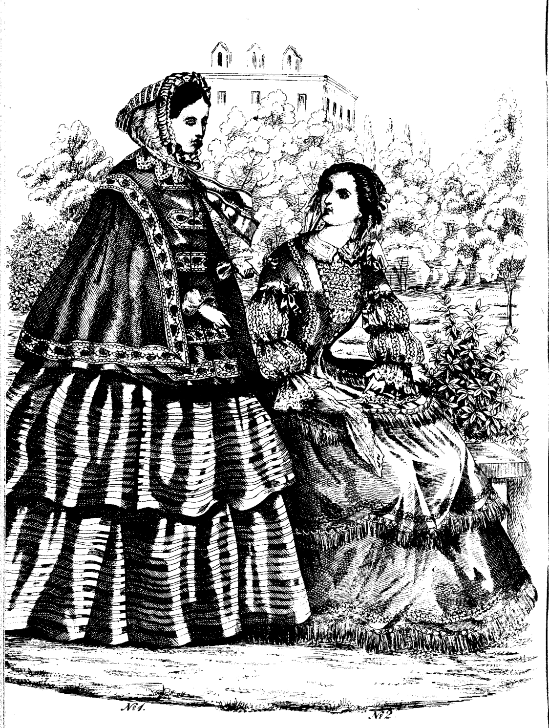
PARIS FASHIONS FOR NOVEMBER.