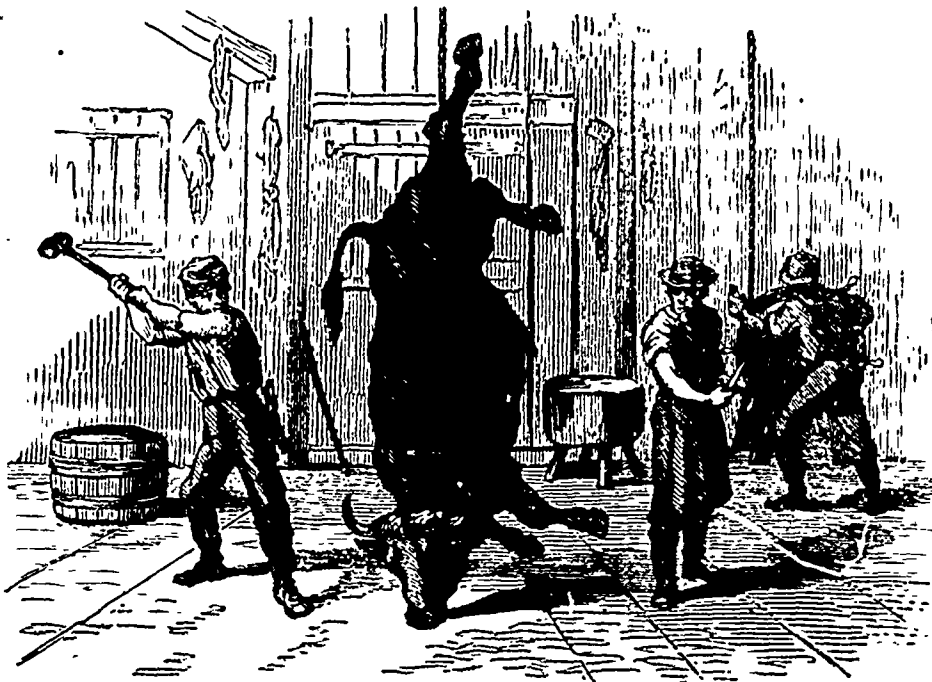
OLD STYLE OF SLAUGHTERING CATTLE.

shed for a run in the yard before the cattle come out. How well they look, their long clean fleeces free of burrs and weeds, and their square, well-built carcasses showing that our friend don't believe in spending his food and care on a poor scraggy animal. The shed they have come out of is clean and dry, with plenty of light and air, good racks, water and grain troughs, and abundant evidence that there is no stint of good sweet clover hay for the flock. Even the pigs are well worth looking at. None of your long-legged, long-nosed landpikes will suit our friend. Such animals are ever getting into mischief, and make very costly pork, of poor quality. And then the large, nicely levelled heap of manure in the yard, that is getting prepared for spring, will be pretty sure to tell for some years where it goes. The more stock a man keeps, if he feeds well and uses the manure judiciously, the more he can afford to keep. Have you ever noticed the fact that a good feeder is almost invariably a good breeder as well? It has got to be a proverb that the greater part of the breed is in the feed; but the truth is, the man who feeds well finds that he cannot get the same return for his outlay from ill-bred animals of any kind as he can get from those that are well-bred; and of course he will raise those which yield the greatest profit. Besides which, the interest he feels in his creatures impels him to keep such as are worth looking at.