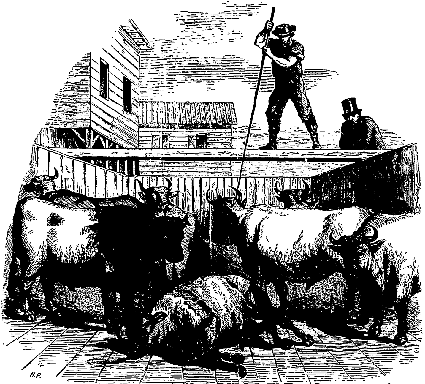
CATTLE SLAUGHTERING AT COMMUNIPAW.

and can only be acquired, it is presumed, by considerable practice; but it should be remembered the fat and fleshy parts on the back of the neck are not, by any means, very sensitive, and if the spear point should miss its aim, it inflicts a wound which gives but little pain. Similar modes of slaughter, based on the same principles, have been for some time in operation in France and other parts of Europe. We believe also that, in the barbarous bull fights of Spain,