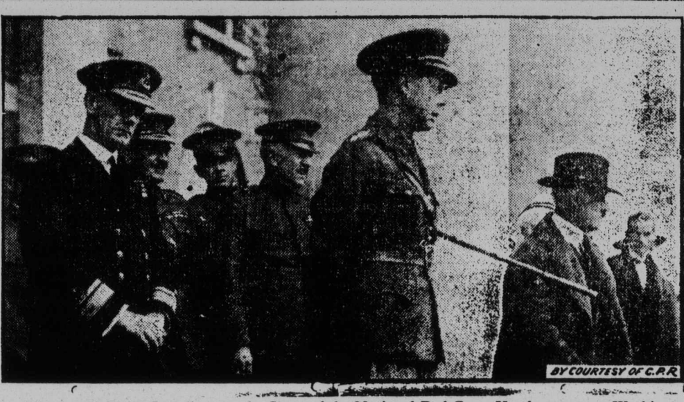
T Prince and Party Standing on the Steps of the National Red Cross Headquarters at Washington,