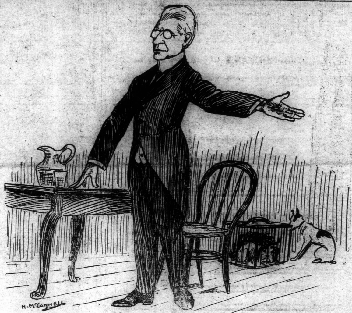
Hugh Guthrie exhibiting the Laurier Navy.