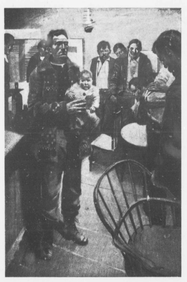
"Make of this child, a Man"