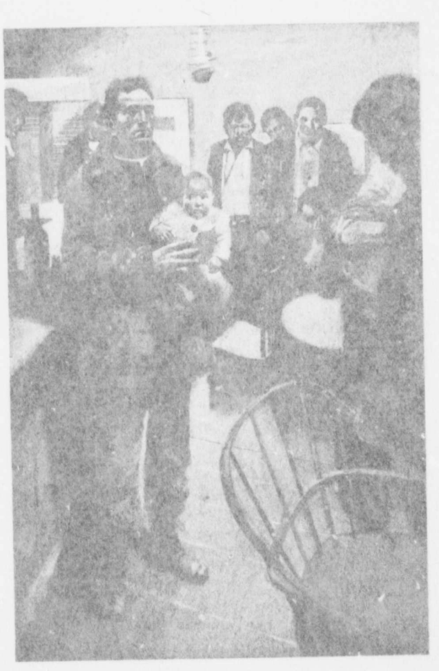
"Make of this child, a Man"