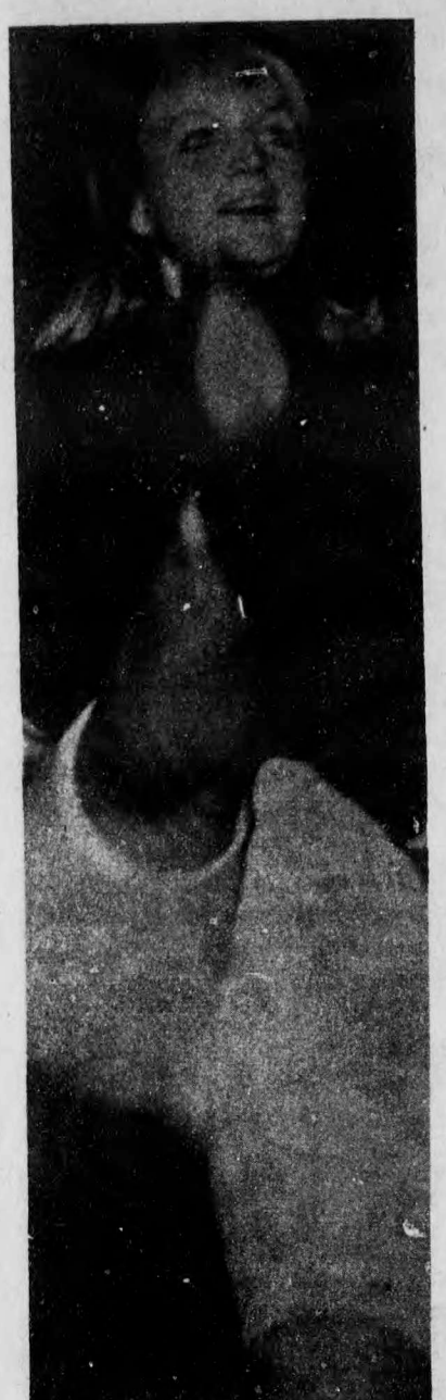
REDN' BLACK ISHERE! OPENSTONIGHT