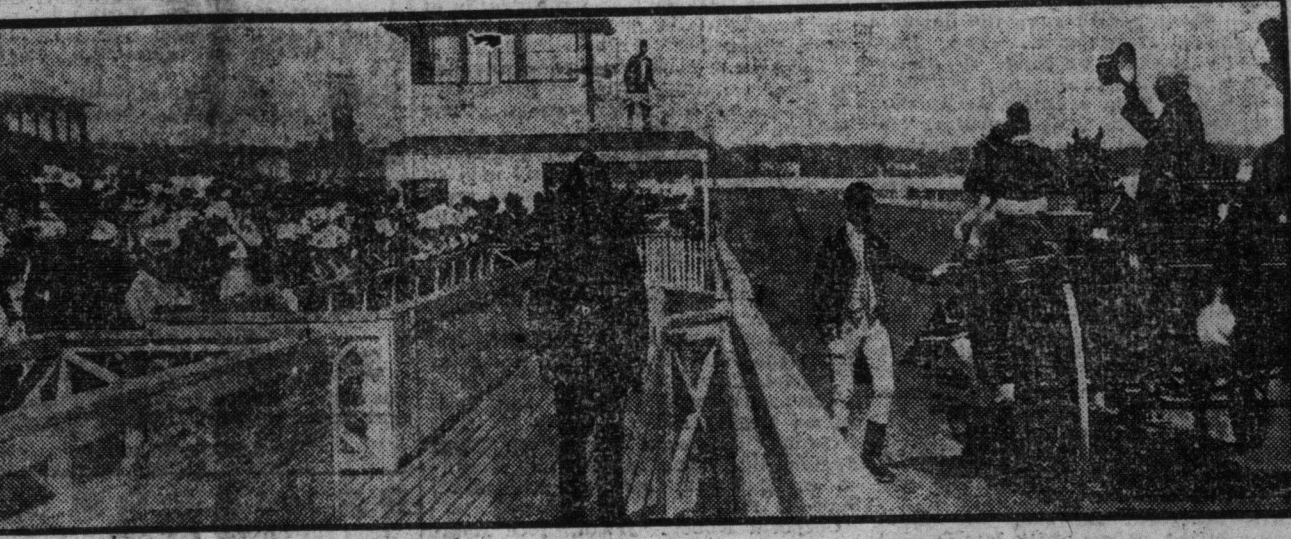
ARRIVAL OF EARL GREY AT MEMBERS' STAND.

There will accompany this parliamentary invitation a specially printed edition of the speeches made in both houses upon the subject of the invitation to His Majesty to come to this country at his pleasure.