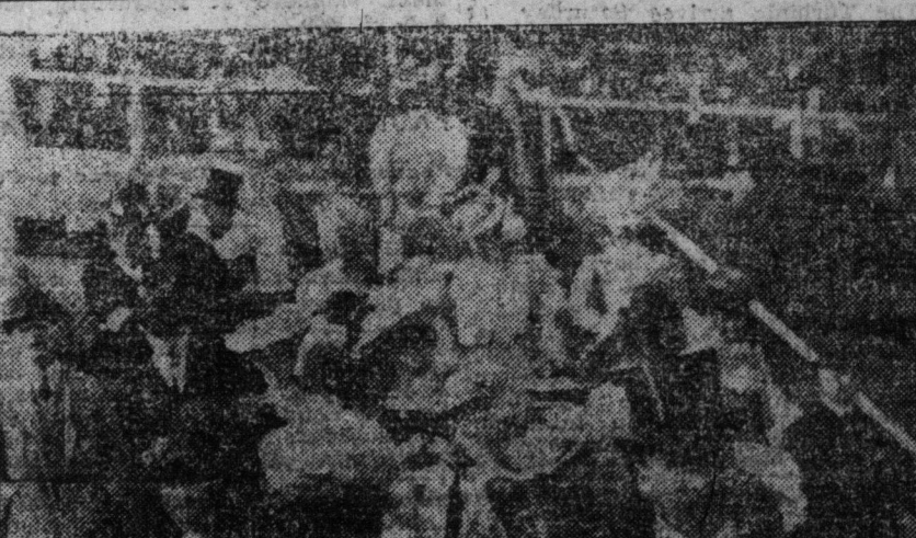
HOW SOCIETY ENJOYS THE RACES.

May 21.—Insurance commission, City Hall, 10.30. O. J. C. races, Woodbine, 2.30. Baseball, Toronto v. Providence, 3.30. Northwest Ratepayers' Association, Dunlop's conservatories, 8.