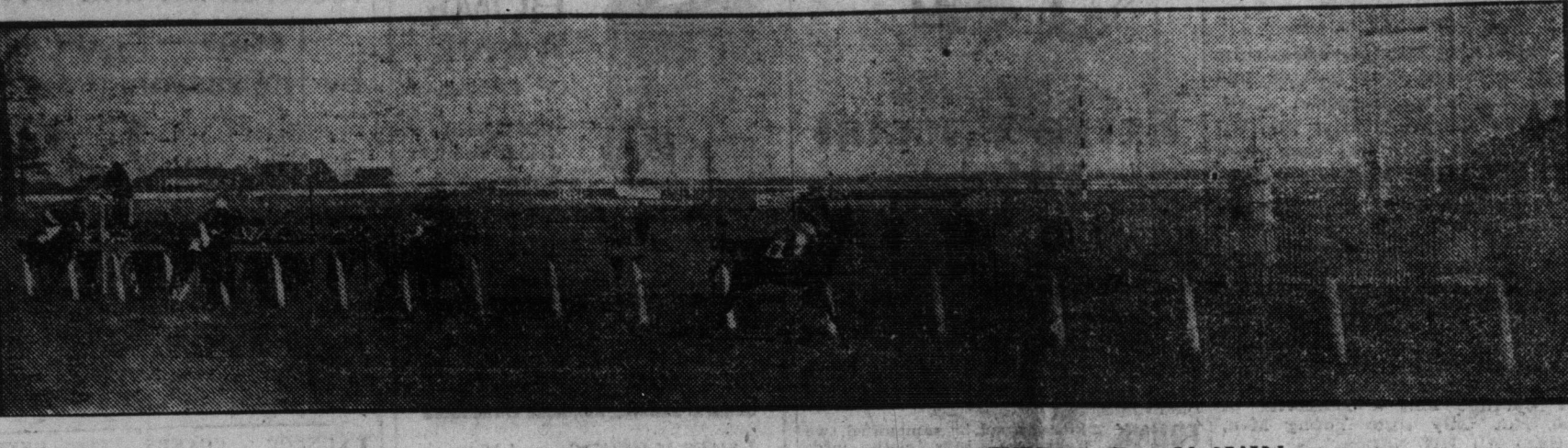
FINISH OF THE KING'S PLATE—SLAUGHTER'S EASY WIN.