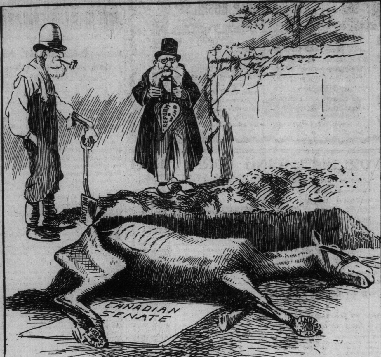
The "COUNTRY" (to "Doc." Cartwright): Oh! you've made pretty well out of him already, doc. I'll be content to just get rid of him and save the shoes.