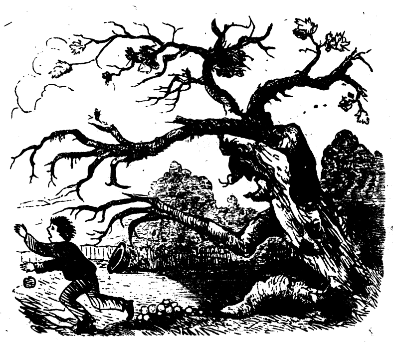
THE APPLE-TREE. (See page 46.)