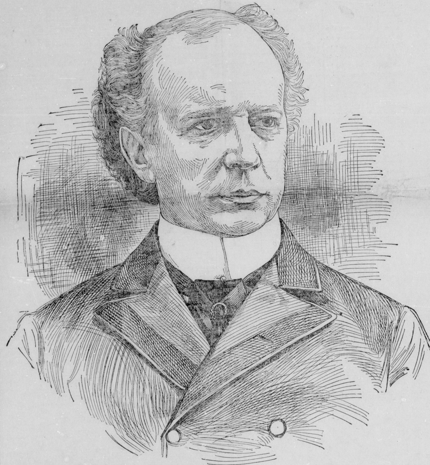
THE HON. WILFRID LAURIER.

A CLEAR MAJORITY OF TWENTY-FOUR, WITH ONE ELECTION TO TAKE PLACE. Quebec Province Voted Strongly Liberal, Giving Mr. Laurier More Than His Entire Majority.