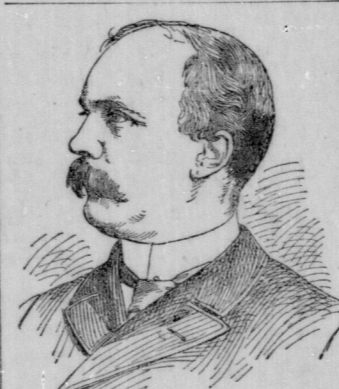
MR. R. PREFONTAINE, M.P. for Maisonneuve.