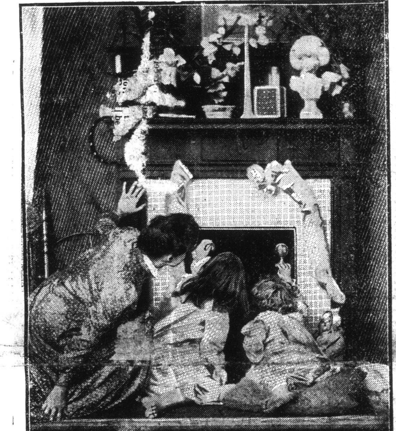
The Night Before.

WHEN it was known in the village that the Duchess was going to spend Christmas at the Castle, there was, as you may believe, a subdued excitement that shimmered in the bosoms of all grades from the "Three Bells" to the Vicarage; and when on the 18th day of December the great lady herself drove up to the lodge in her fine blue coach, the whole place turned out in the crumbly snow to gaze and wonder. For though it was ten good years since the "old Duke" had died, and though the Castle had been left to the Duchess for life, this was her first visit to it as a widow, so no wonder the village folk in the snow and gaped, for duchesses are not to be met with as plentifully as sheep in a market town, as everyone knows. As to this particular one, the village could hardly call her to mind except as a self-sufficing person of very mild and gentle nature. Mark this well, you will read for it has a bearing on what follows.