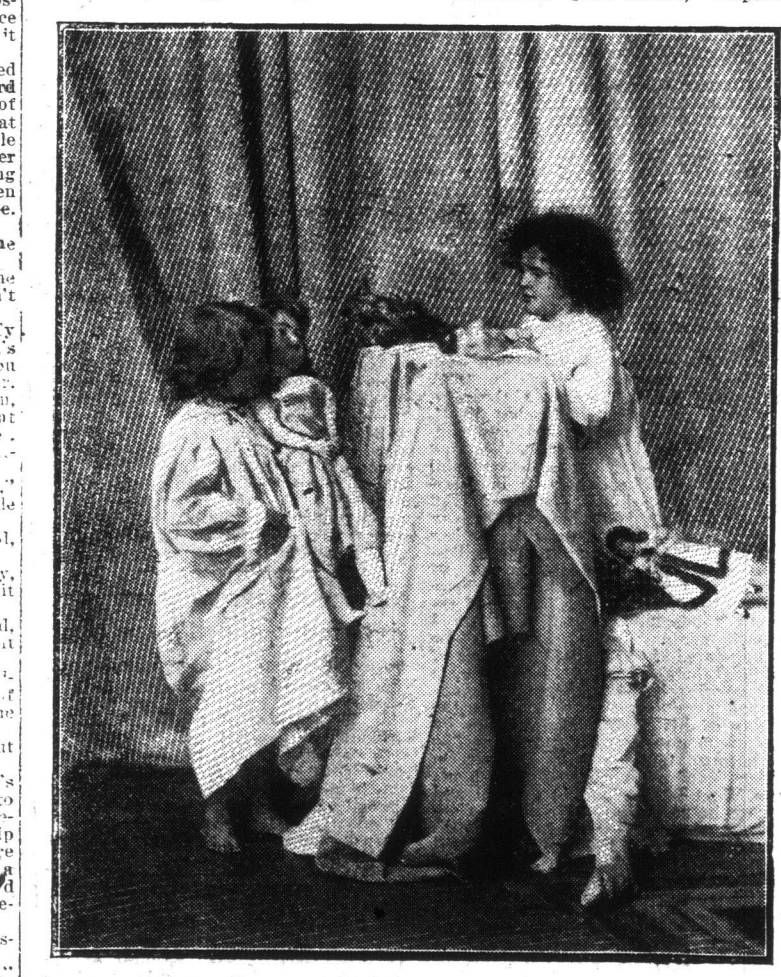
The Christmas Bazaar.