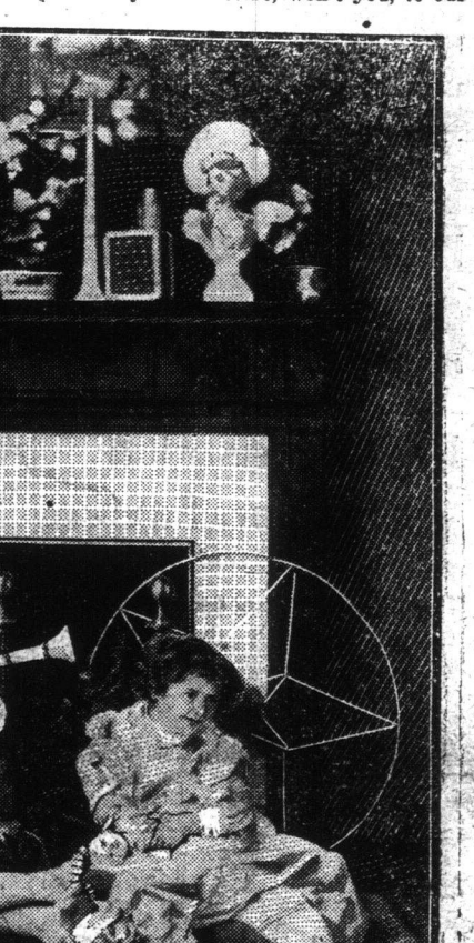
The Morning of Christmas.

frible old woman" was quite intelligible English.